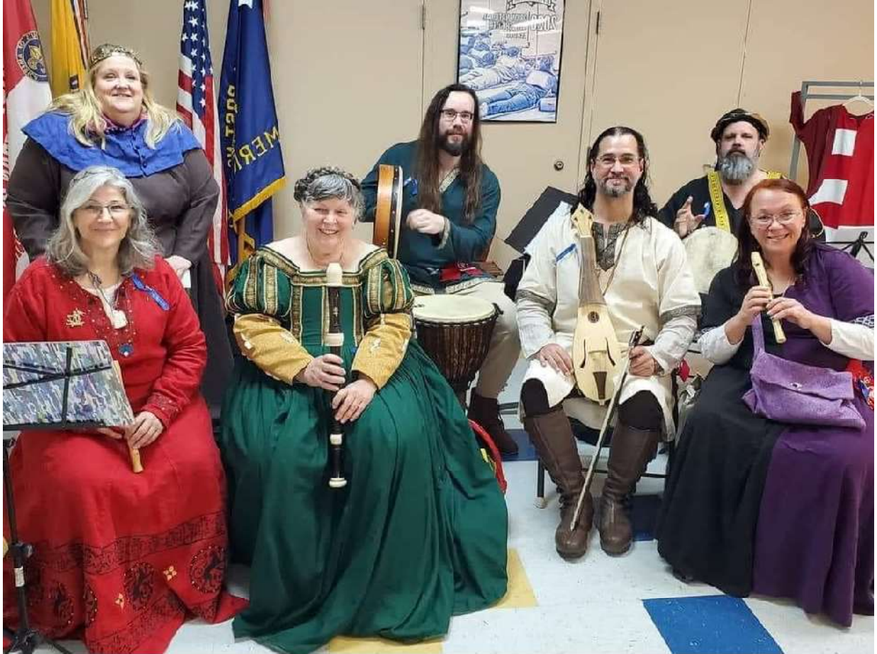
Here are some of the wonderful musicians who played during Defending the Gate. Thank you for adding to the magic of the day!